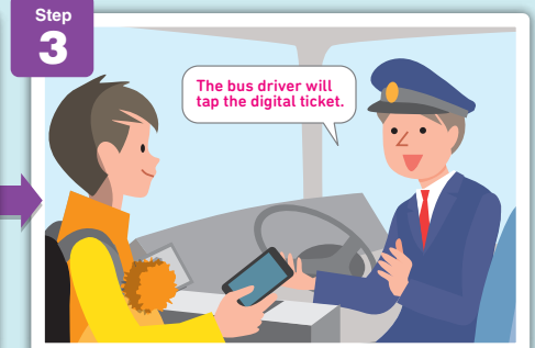
Step 3 On the return bus, (for Yudanaka Sta.) show the digital ticket screen on your smartphone to the bus driver.