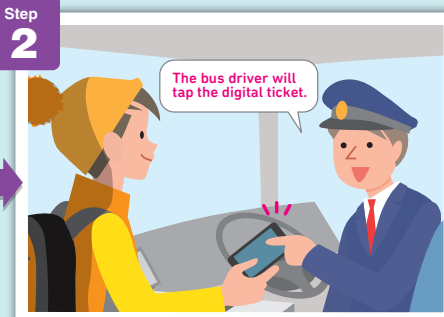
Step 2 On the bus, show the digital ticket screen on your smartphone to the bus driver.